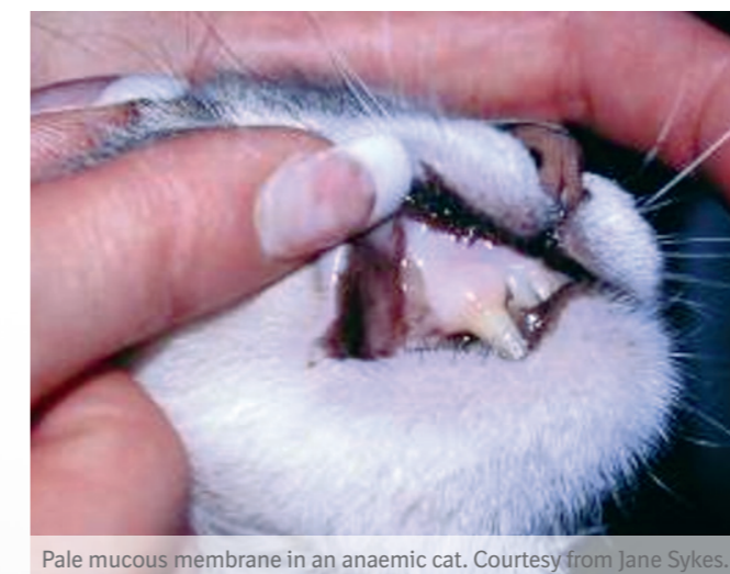
Pale mucous membrane in an anaemic cat.

Immune-mediated hemolytic anemia (IMHA) is associated with most vector-borne infections in cats 8,10,26 , especially infection by piroplasms ( Babesia felis and Cytauxzoon felis ) 1 .