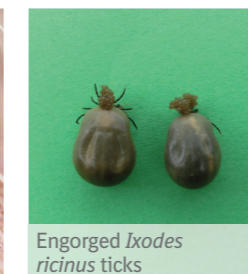
Engorged Ixodes ricinus ticks