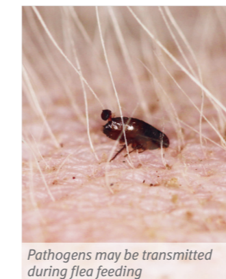
Pathogens may be transmitted during flea feeding

But surveys worldwide show that they are nevertheless at risk of tick infestation 3,16 , and therefore exposed to tick-borne diseases 5,7,24,25 , sometimes even when their owners qualify them as indoor cats 16 . When it comes to fleas, it is well-known that cats may be infested at any time whatever their lifestyle, and therefore infected by flea-borne pathogens 12,22,23 .